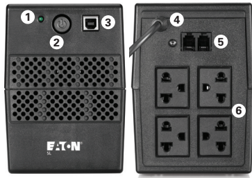
600VA / 800VA