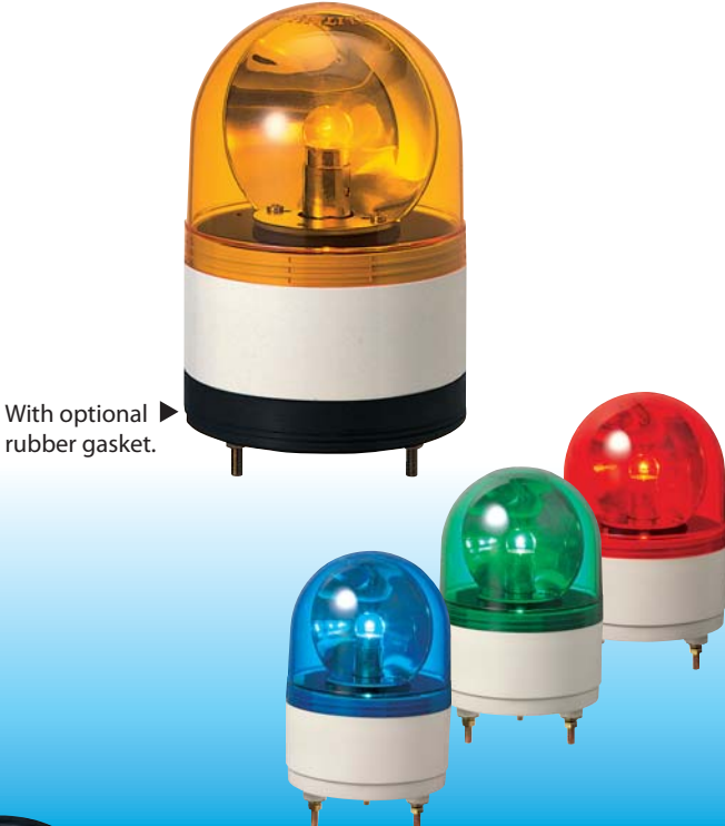
With optional rubber gasket.